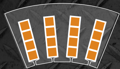
High Slot-Fill Square Wire

Breakthrough wire design created the smaller and lighter weight models.