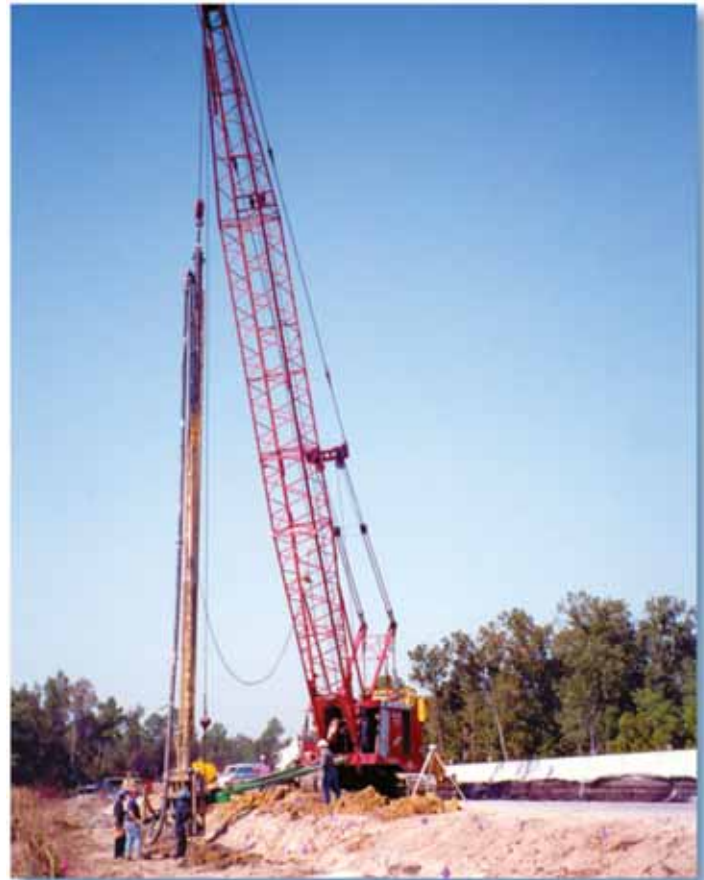
Vibro Concrete Column equipment mounted on a crawler crane.

To ensure that a smooth transition would be attained between the pile-supported bridge and the new embankment, FDOT required minimal embankment settlement adjacent to the bridge, and an increasing allowable settlement with distance from the bridge.