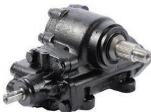
Part #: N503-0159 2002-06 Cadillac Trucks Escalade, Escalade EXT, Chevrolet/GMC Trucks Avalanche, Silverado SS, Sierra Denali; 2003-06 Cadillac Trucks Escalade ESV; 2001-06 Chevrolet/GMC Trucks Silverado, Sierra Series Pickup (2WD & 4WD), Suburban, Yukon XL, Yukon Denali, Yukon Denali XL, Tahoe, Blazer (Full Size), Jimmy (Full Size)