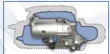
IIF Starter P5.0 Starter

Contact Your DENSO Sales Rep Or Visit www.DensoHeavyDuty.com For Updated Application Information