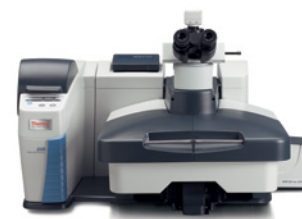
Thermo Scientific DXR Raman microscope or Thermo Scientific Nicolet iN10 microscope For small particle identification or high spatial resolution polymer characterization needs