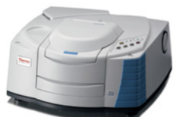
Thermo Scientific Nicolet iS10 FT-IR spectrometer For high performance, polymer QA/QC and analytical services