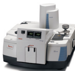
Thermo Scientific Nicolet iS50 FT-IR spectrometer For polymer method development, deformulation, troubleshooting and research