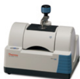
Thermo Scientific Nicolet iS5 FT-IR spectrometer For high productivity QA/QC of polymers and ingredients

* ATR is a useful tool for basic material characterization