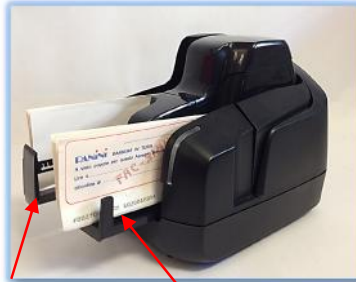
Pocket Extension Feeder Extension