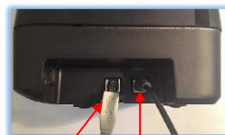
USB Interface Power Connection