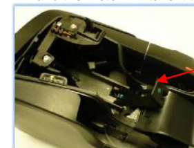
AGP nest in load position and plastic latch opened