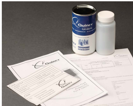
Fluid Analysis Kit

Quincy Compressor's fluid sampling program allows customers to understand the condition of their compressor lifeblood: fluid. Local atmospheric conditions, operating temperatures and other factors can increase or decrease fluid life. Furthermore, some contaminants can damage internal metal components or seals. Fluid sampling eliminates the guesswork, providing a comprehensive yet easy-to-read report on the exact conditions of your compressor's fluid.