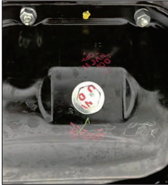
Figure 2. Indication of Inspection Label Removal